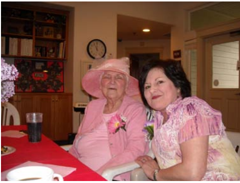
Mothers Day was FABULOUS! Thanks to all of you and staff!